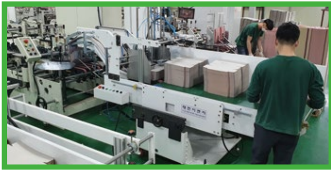
Automatic feeding mode