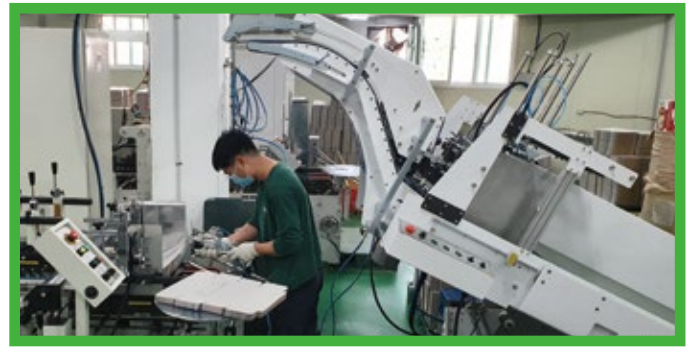
Manual feeding mode