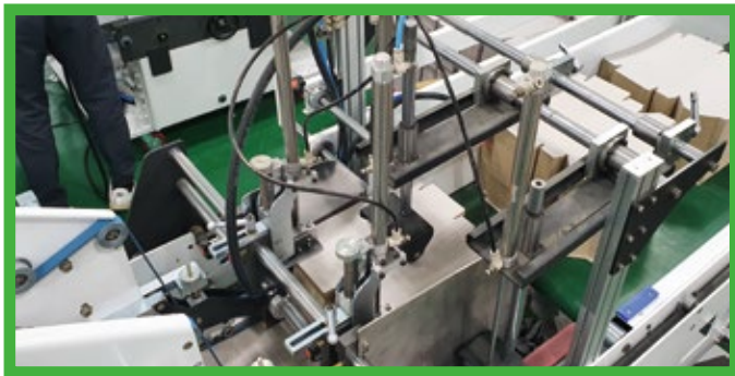
Press cylinders for warped blanks