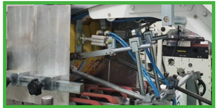
Push lays for feeder